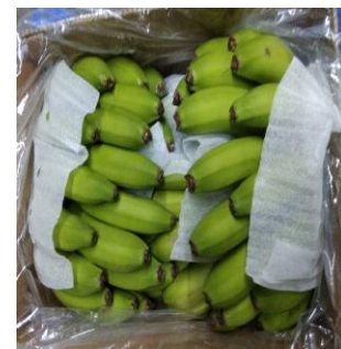
Day-1 (Inside Cold Storage at 13°C & 95% RH)